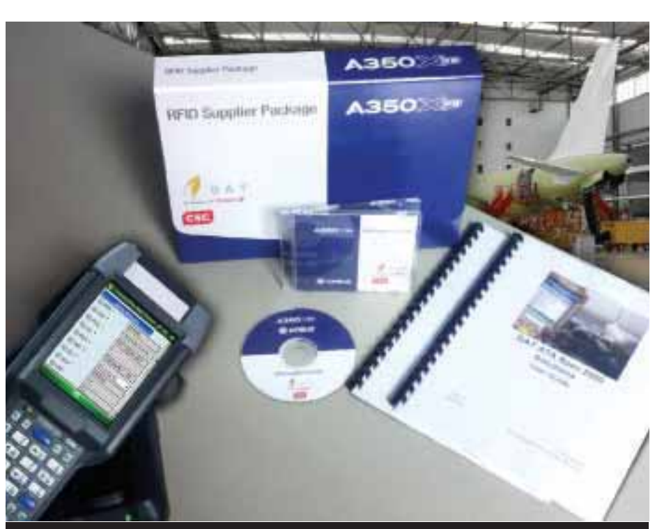
Left: TAP opted to use handheld readers for its engine components RFID solution. Above: OATSystems is providing software for the A350 part marking programme.

"RFID is a very old technology compared to the computers and cell phones we are all using," says Sowa, pointing to the emergence of RFID during World War Two. The capability is widely used today across numerous industries such as retail, where it plays a central role in anti-theft devices. Unlike bar codes, RFID tags offer the special advantage that they do not require line of sight with the reader and can thus be embedded in the object which is to be tracked. Other capabilities include: the simultaneous reading of