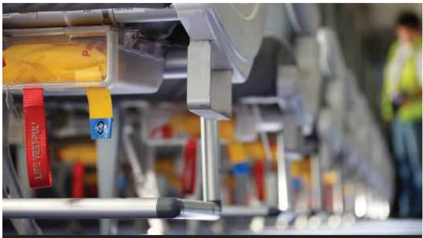
Life vests and other emergency equipment are a popular choice for RFID. LHT offers 'avio check' as a solution.